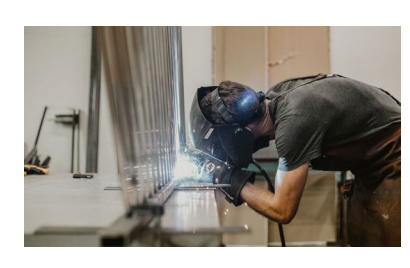
UnSplash: DOWNLOAD LINK