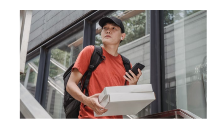
Pexels: DOWNLOAD LINK